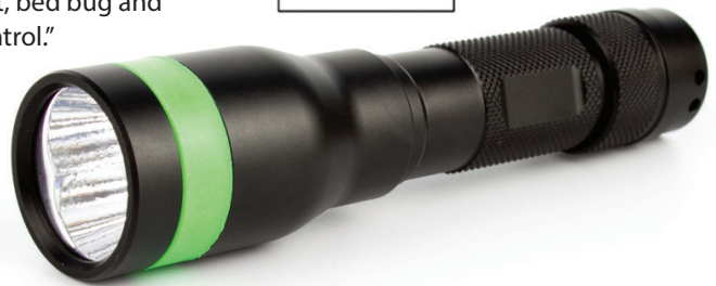
The Ensystem Dual Power Light. Pictured above: The dual white LED and ultraviolet (UV-A) bulbs, side-by-side.

and it's convenient in a pouch on your side," Bishop says.